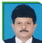
Zafar Iqbal College of Agriculture, University of Sargodha, Sargodha, Pakistan