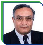
Moustafa El-Shenawy National Research Center, Egypt