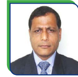
B N Hazarika College of Horticulture and Forestry, India